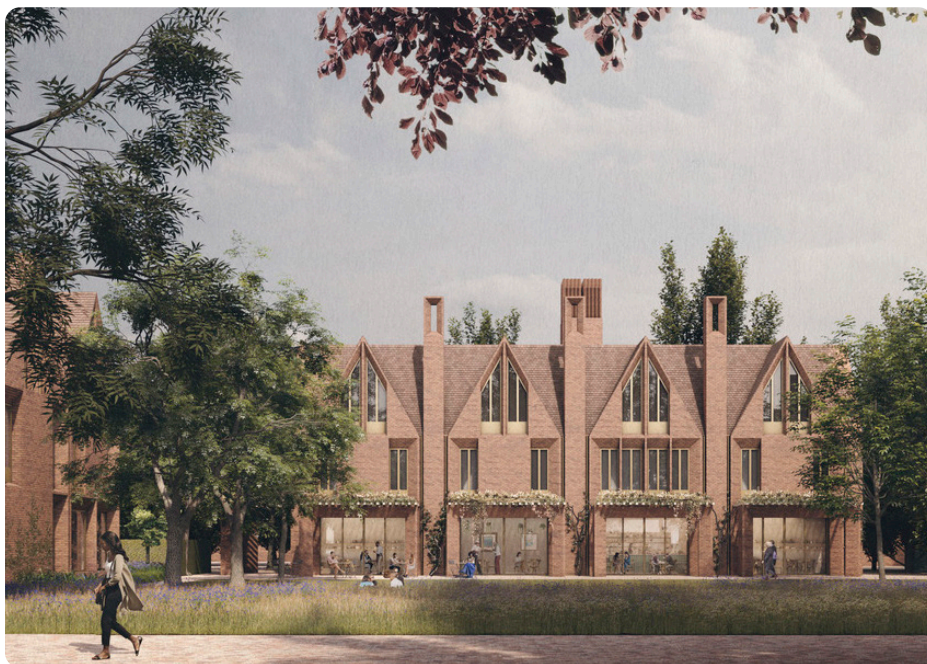
Artistic impression of the project