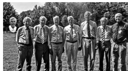
Survivors of Univ's 1952 & 1953 VIII's – at Henley Regatta in July 2015