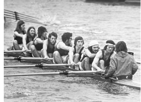
The 1974 crew in action and their crew list