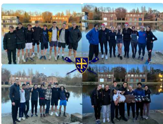
Univ Novice Crews post Ergatta

Clockwise from top left: MNA, WNA, MNC, MNB