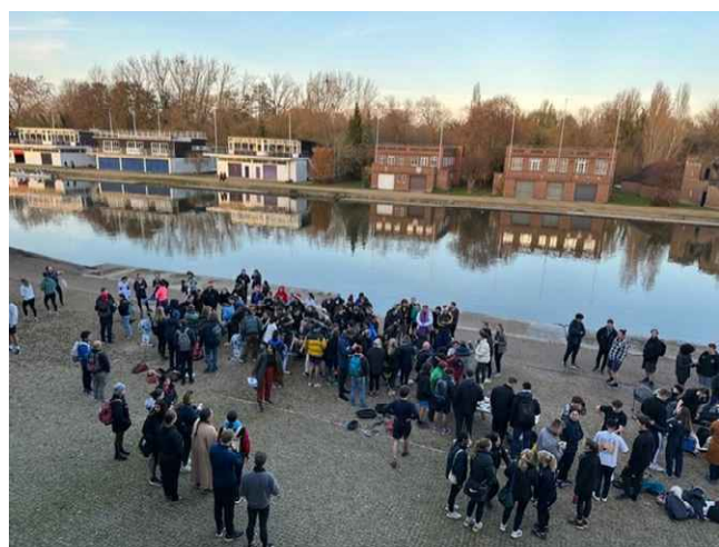
Univ Ergatta in Full Swing

Our novice men*s side has been both strong and numerous after we had a great turnout on our taster day and subsequently formed two novice men*s crews, with over 20 aspiring athletes in total. Once we settled into the terms of training, there was unfortunately limited opportunity for our crews to get onto the water as the Isis River level was definitely not on our side! Regardless, our novices remained dedicated to their crews and spent many hours getting to grips with the sport, whether that be in the tank, on the ergs or through attendance at club circuits. Their collective commitment and camaraderie shown this term bodes well for the future of UCBC.