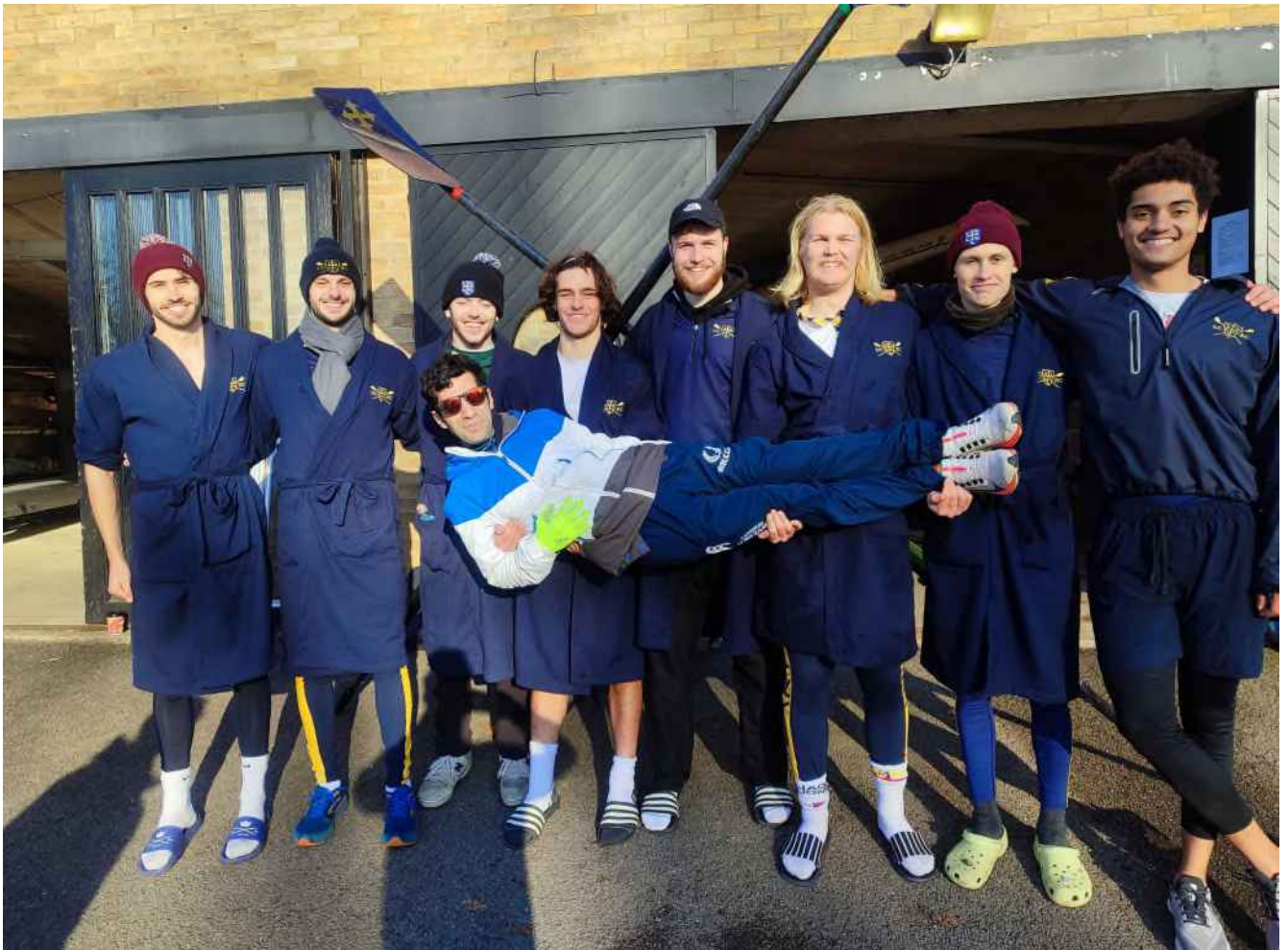
Fairbairns Regatta 2023: M1 staying warm in their UCBC branded dressing gowns post race