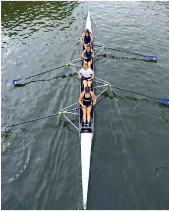
Left: W2 ready to race at Fairbairns