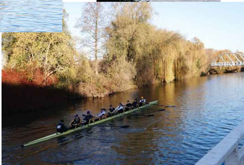
Left: M1 at Fairbairns