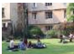
Pages 20 University College's men's first VIII rowing in Torpids.