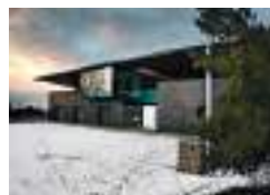
Pages 11–12 The University College boathouse on the River Thames.