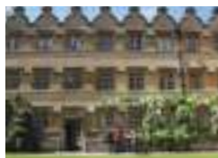
Page 5 Students in the Quad at Univ.