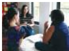
Pages 20 A student kitchen in The Goodhart Building.