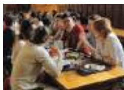
Pages 15–16 Students enjoying lunch in the dining hall at University College.