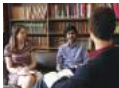
Pages 7–8 Students in a tutorial.