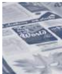
Students can also become involved with university-wide societies and clubs as well as those available at Univ. The Univ Alternative Prospectus - which can be found on the college website - offers a rich insight into this side of student life.

We have a wide range of sports clubs from rugby to darts, from rowing to badminton. Anyone can take part in College sport - whatever their level of achievement or experience. Our sports facilities are located approximately 10 minutes away by cycle ride and students benefit from a state-of-the-art boathouse on the River Thames. Univ is also a 10 minute cycle from the University's main sports facilities. All Univ students get free access to the gym and swimming pool in addition to being able to use a small gym/exercise room on the College's main site.