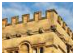
Cover Gargoyles on the Radcliffe Quad tower at University College.