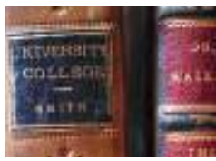
Page 1 Book spines in Univ's historic library collections.