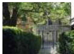
Pages 3–4 The gates leading onto Logic Lane.