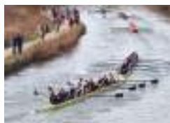
Pages 20 Students studying outside in one of University College's Gardens.