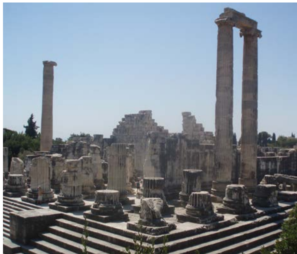
Lucy Fisher: Didim, Turkey

After Antalya we travelled up the coast visiting more well-known and