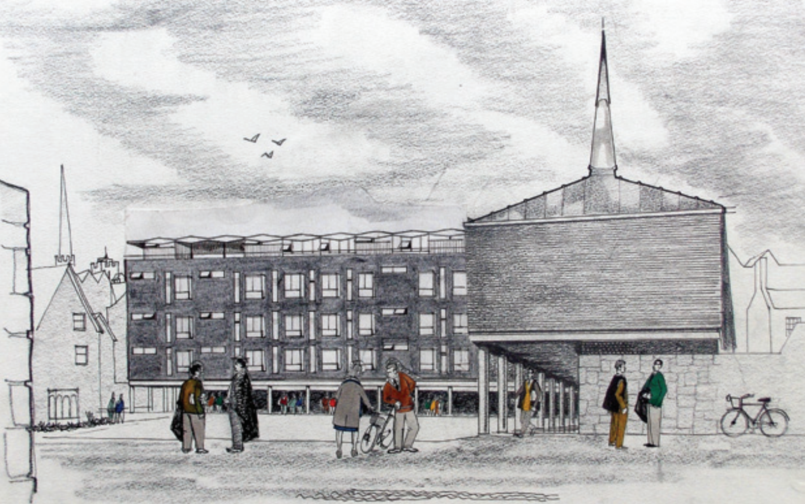
New Building, University College, Oxford. February 1960.