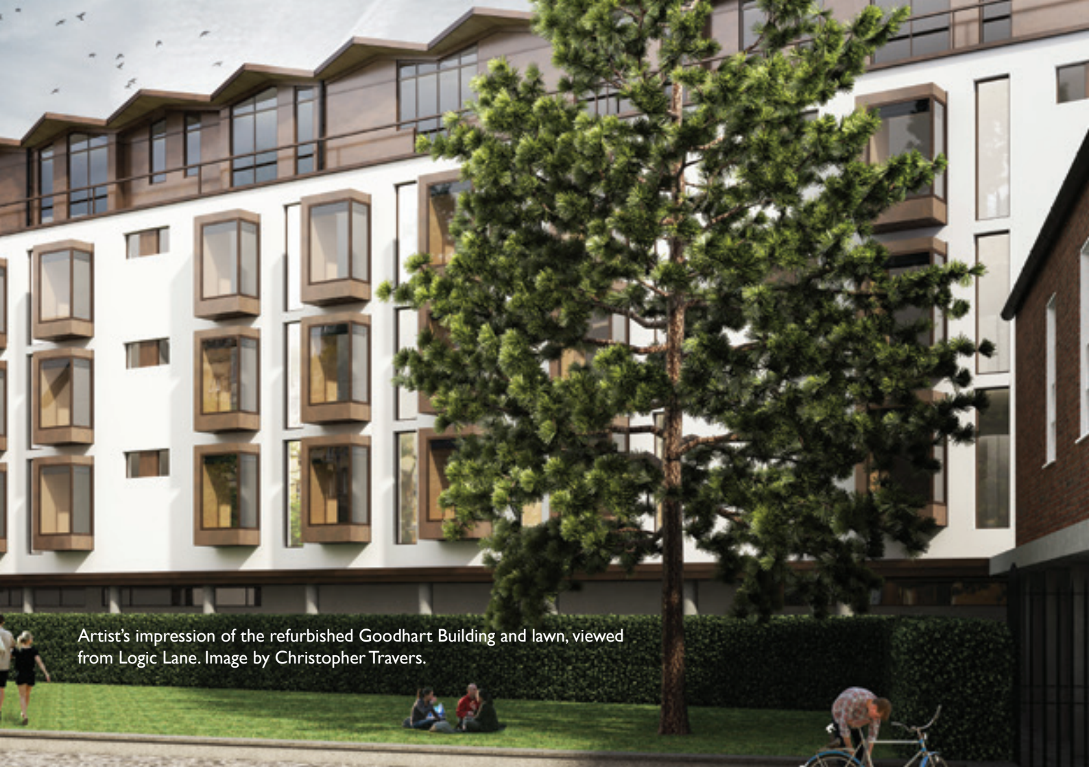
Artist's impression of the refurbished Goodhart Building and lawn, viewed from Logic Lane. Image by Christopher Travers.